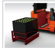
Option battery side pulling